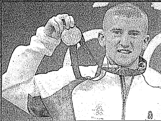
Light flyweight Paddy Barnes won Olympic bronze in Beijing in August.