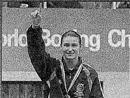
Katie Taylor retained her world title last month in Ningbo City, China.