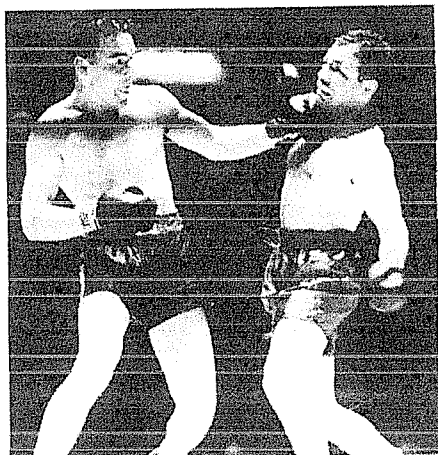
Jimmy McLarnin trades with Tony Canzoneri in a battle of future hall of famers. In an unforgettable career, McLarnin fought 14 different world champions.

J immy McLarnin was a gifted boxer who carried a payoff punch in both hands. Born in Hillsborough, County Down, he emigrated to Canada as a child and did his fighting in the USA. At first glance, his record of 63-11-3 (20) is not overly impressive. The key to his greatness was the quality of his opponents; no fewer than 16 were world champions, and he beat 14 of them. His three welterweight title fights with Barney Ross were ring classics. Now in his mid-80s, he lives in California.